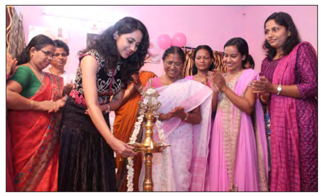
Beautician Course Inauguration