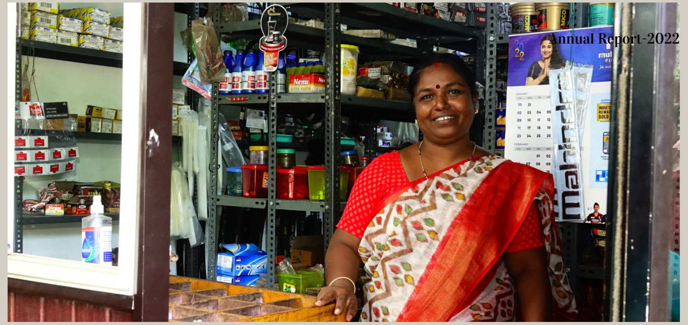
Spare parts unit