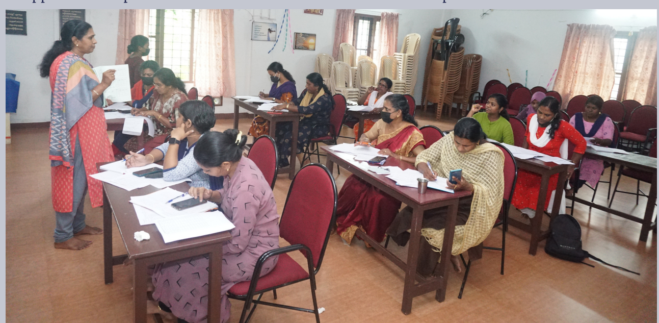
Our Motto:"I have come that they may have life, life in abundance" (Jn:10:10)

One of the main pillars for the successful functioning of CAG is book keeping and proper accounting. To track the expenditures, take appropriate decisions, organize and manage its activities for the successful functioning and existence of CAG, this training became an inevitable element. 186 leaders were trained from 66 newly formed CAGs. This training also supported entrepreneurs to maintain the accounts of their enterprises.