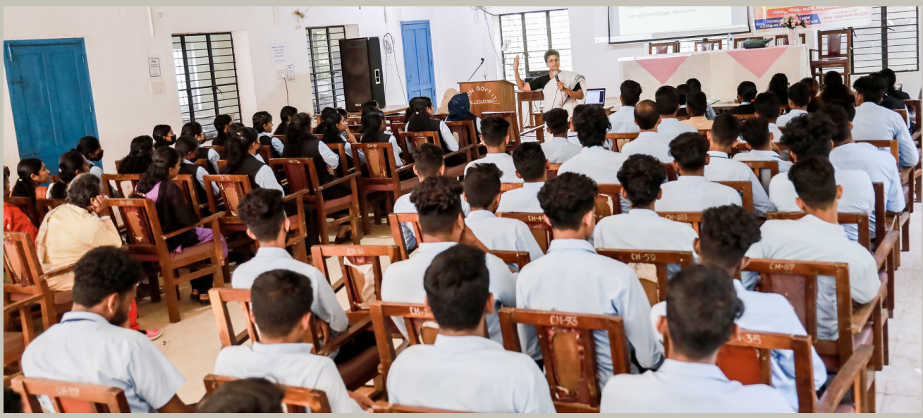
Awareness class on Dowry Prohibition Act for College Students