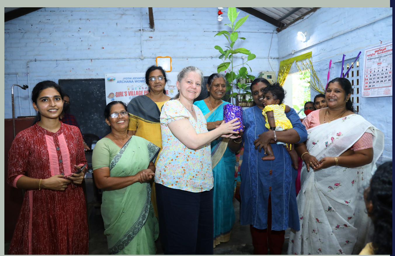
Ayur Jack Plant Distribution

Despite all the efforts to give shape to an equality – sensitive social culture, the chauvinistic forces still raise the ugly head in various forms of violence against women. The infantile foeticide is one way by which this inhuman practice is still being perpetrated. To highlight the social supremacy of girl child we have launched the "Thalitha Cume" (Little Girl Arise) project in selected village by which we impart the message of equality of girls. We make the birth of a girl child an event of celebration to motivate the parents to enlist the child into the girl-friendly saving scheme "Sukanya in postal Dept. where they get higher yields and returns benefitting the education of the girl child and give the families special incentives to give better care for the girl child. Such villages are gradually got declared to be gender – just and friendly, by following up with intense awareness building campaign on the need and importance of eliminating gender based violence both at home and in society.