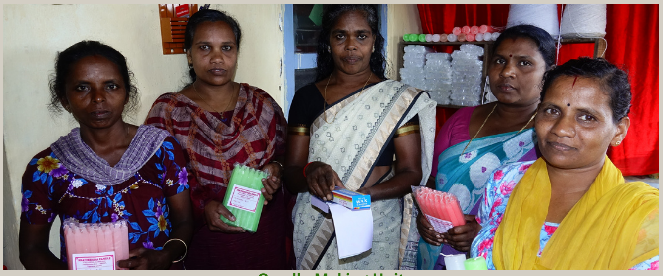
Candle Making Unit