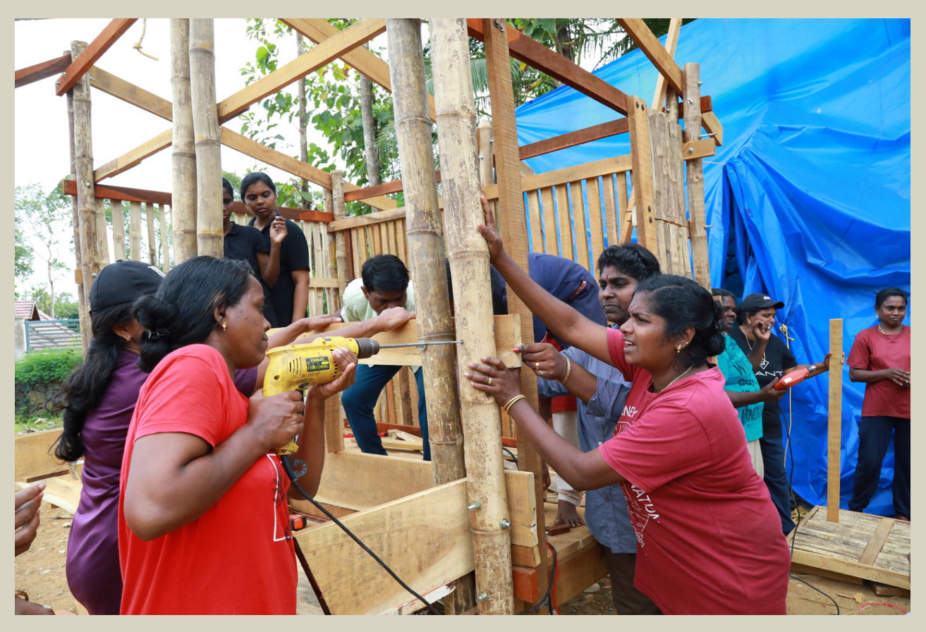
Bamboo Treating and Animal sheltering

The women who successfully completed the training were further assisted to employ their newly acquired skills into productive enterprises by helping them get the basic resources and technical guidance required. Out of the 323 women who had undergone those trainings 218 women have so far started their self-help production programmes mostly in cohort with the CAG network.