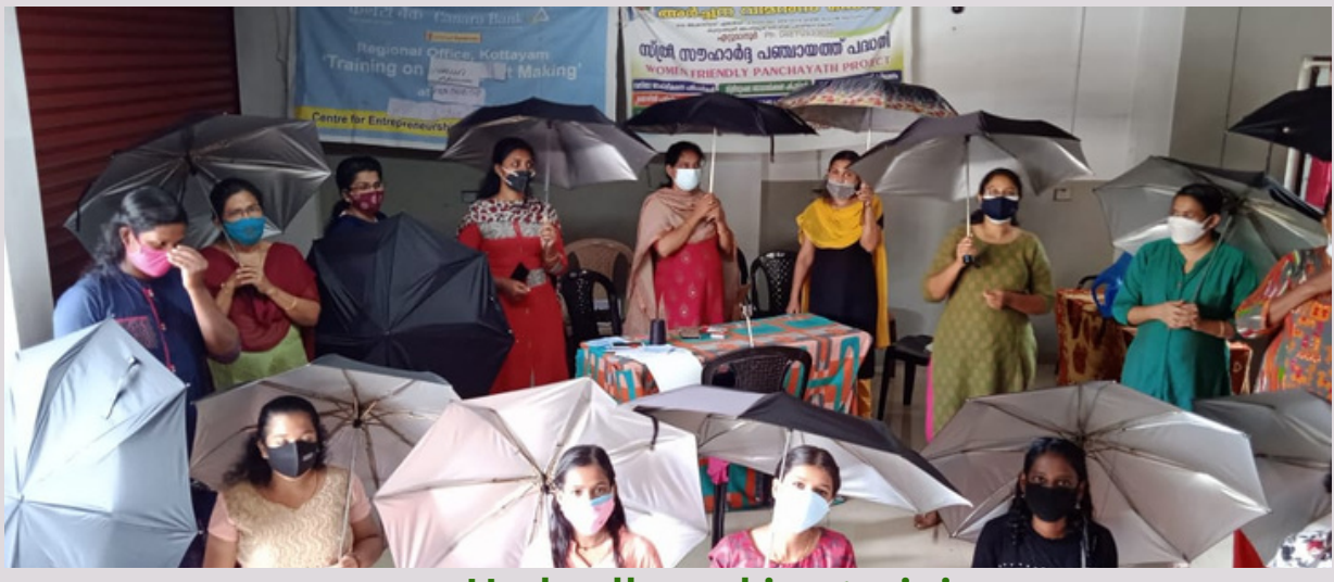
Umbrella making training