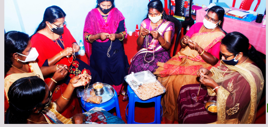
Rosary making training