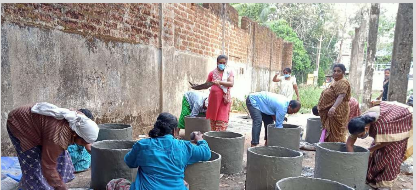
FERRO-CEMENT TANK MAKING TRAINING

We trained two batches of 15 women to make Ferro-cement tank to recharge wells. Through the training provided, the participants were able to earn Rs.350 for one tank and could make 2-3 tanks daily. The women are earning a decent income and have regular employment. They could finish necessary maintenance work of their houses and enjoy their right to a decent shelter. During the pandemic they were able to repay their loans and meet the daily needs. Their husbands assist them in household duties so they have more time to produce the tanks. These women have been able to earn due respect of their families which is a much desired outcome of the power given to women in this section.