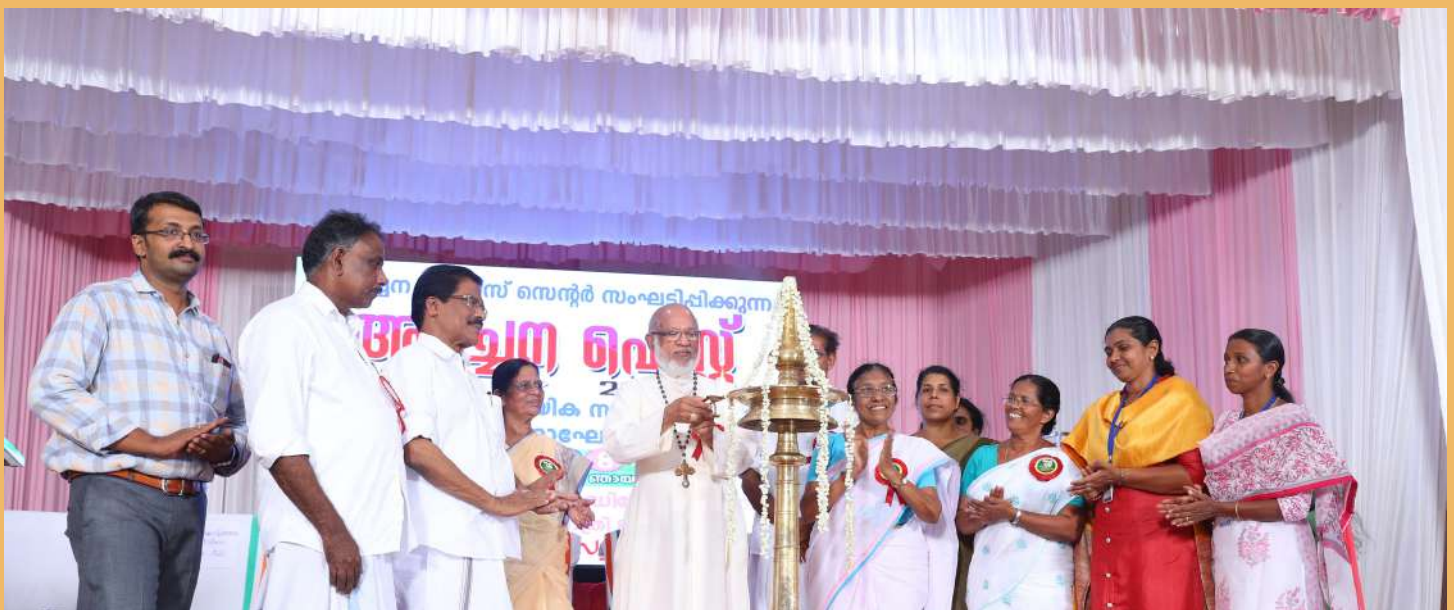
Function was inaugurated by Cardinal Mar. George Alencherry, the Major Archbishop of Syro-Malabar church.

The annual fest that we have been conducting in connection with the Women's Day Celebration, was conducted with wide community participation, and enthusiasm in this year too.The event was a 3 days program, coinciding with a massive women's March proclaiming the grit and determination of the discriminated gender community to regain its rightful space in the socio-economic spectrum. The event was also an occasion to showcase the achievements of the women groups, and put our mission and ministry into public domain. Women & Micro Enterprises, Women & Agriculture, Women as Path breakers in high end skills such as masonry, carpentry, plumbing, etc. were attractively and empirically displayed during the fest. A public meeting, and cultural event to highlight the state of women in Kerala were enacted. The functions were graced by leaders from Government, the Church, civil administration.