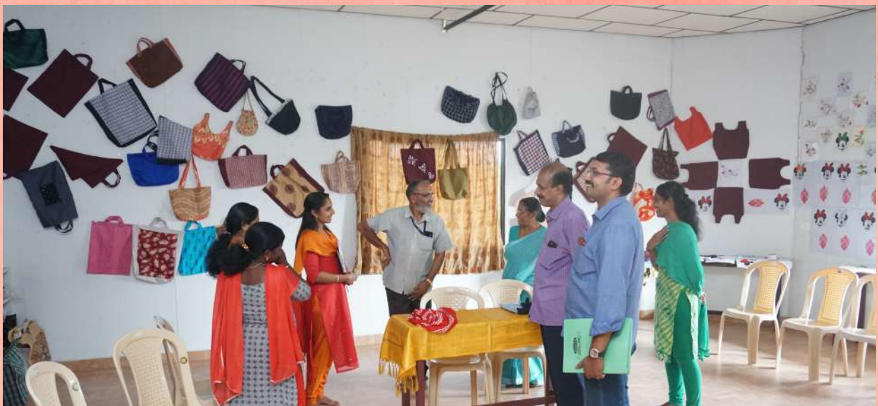
TRAINING EXHIBITION & EVALUATION

From January 1st 2020, Government of Kerala banned the use of plastic bags. This was perfect time to step into environment friendly bag making business in various states of India. Government is taking necessary steps in educating people about hazards of plastics and related materials, and in many states of India we see that use of environment friendly carry bags have overtaken plastic bags. Kerala alone had demand for over millions of environment friendly carry bags in a month. In collaboration with NABARD we had conducted training for 3 batches, totally 96 members benefitted from it. They started production units and are earning a decent income.