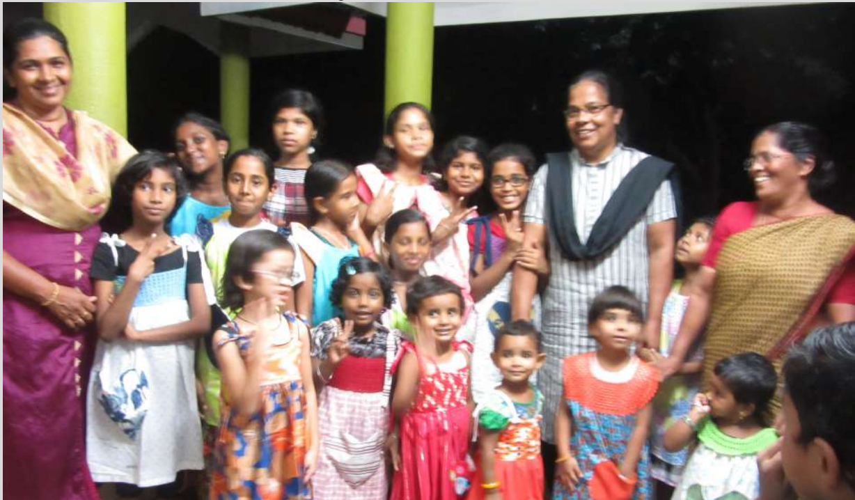
Visit of Childer's Home