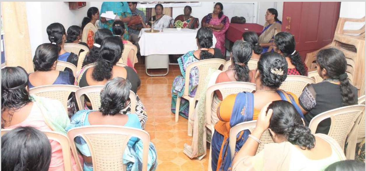
Domestic Violence Classes