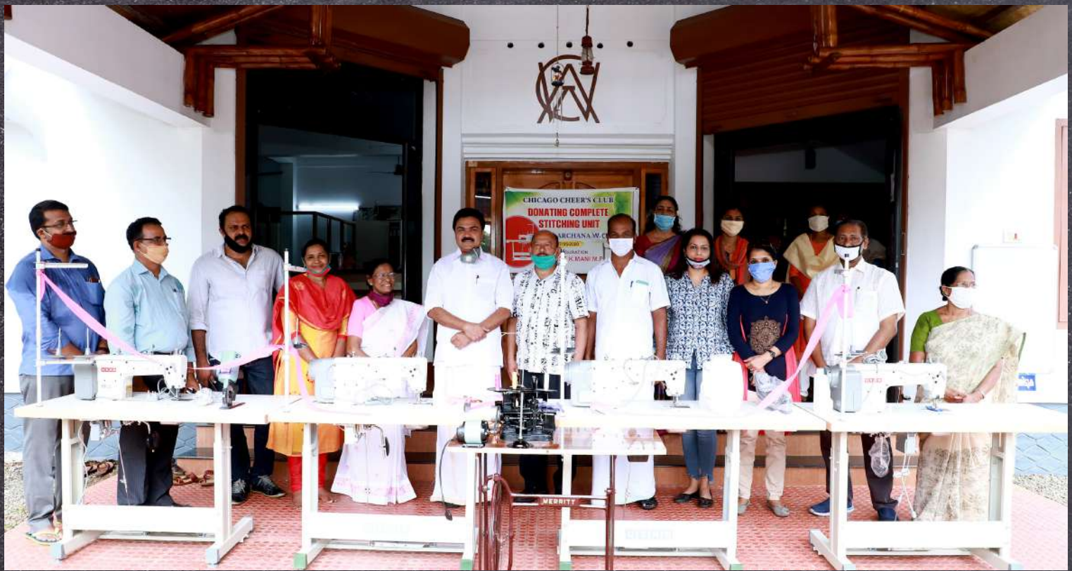
The unit was inaugurated by Kottayam MP Jose K Mani.