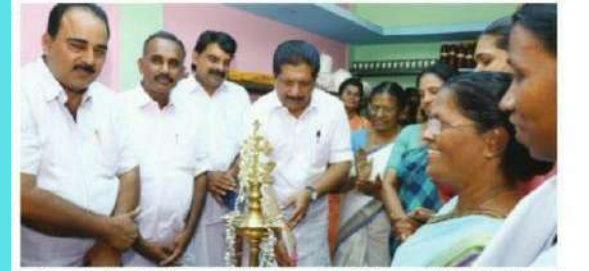
അർച്ചന വിമൻസ് സെന്ററിന്റെ നേതൃത്വത്തിൽ കടുത്തുരുത്തി പാലം റൂറൽ കാമ്പയിൻ വിമൻസ് സെന്റർ അർച്ചനാസ് റൂറൽ മാർട്ട് പ്രവർത്തനമാരംഭിച്ചു.

അർച്ചനാസ് റൂറൽ മാർട്ട് പ്രവർത്തനമാരംഭിച്ചു കടുത്തുരുത്തി: അർച്ചന വിമൻസ് സെന്ററിന്റെ നേതൃത്വത്തിൽ അർച്ചനാസ് റൂറൽ മാർട്ട് പ്രവർത്തനമാരംഭിച്ചു. അർച്ചന വിമൻസ് സെന്ററിന്റെ നേതൃത്വത്തിൽ അർച്ചനാസ് റൂറൽ മാർട്ട് പ്രവർത്തനമാരംഭിച്ചു. അർച്ചന വിമൻസ് സെന്ററിന്റെ നേതൃത്വത്തിൽ അർച്ചനാസ് റൂറൽ മാർട്ട് പ്രവർത്തനമാരംഭിച്ചു.