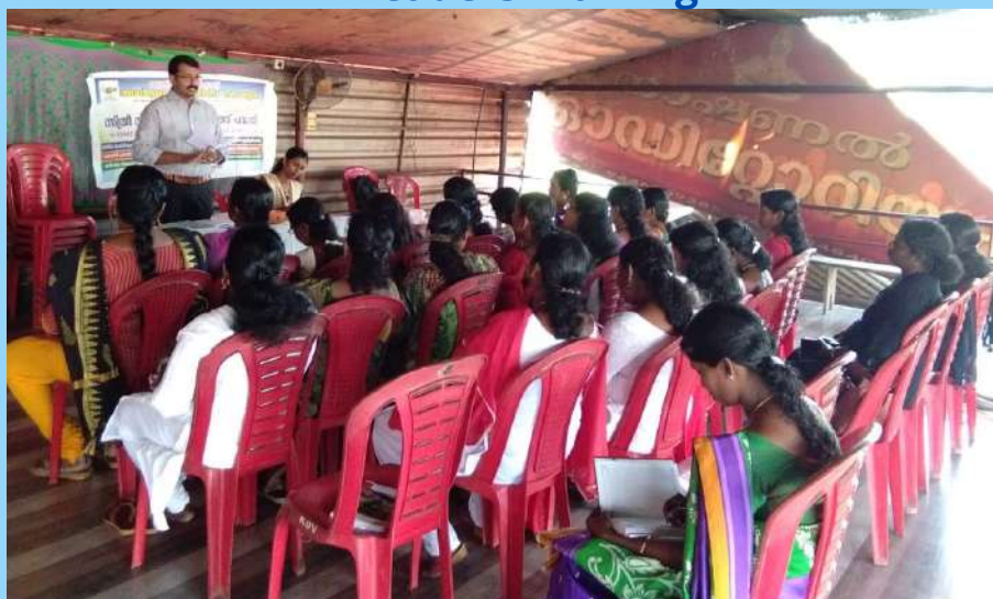
Monthly Evaluation Meeting