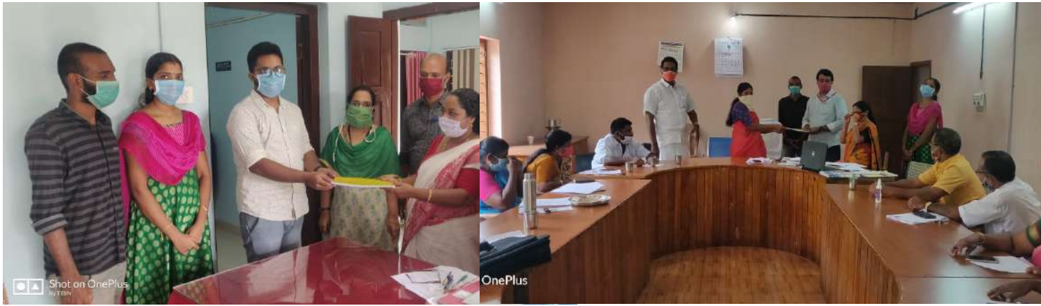
HSS DPR Submission