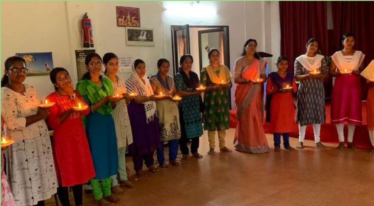
A final ceremony