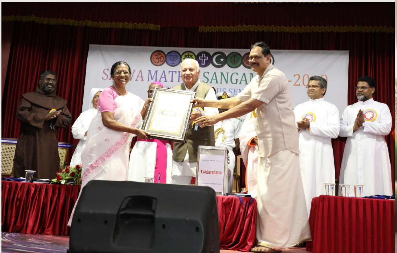
Socio- Spiritual Entrepreneurship award form Kerala Integral Renaissance Action Forum award given by Hon. Kerala Governor Arif Muhammad Khan