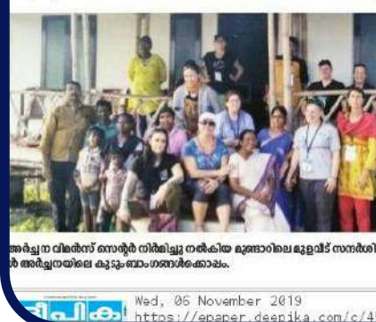
അമേരിക്കൻ സംഘം അറബിയിൽ സന്ദർശിച്ചു. പ്രമുഖരായ പ്രവേശകരുടെ അതിർത്തിയിൽ സന്ദർശിച്ചു.

കുടുംബശ്രീയുടെ വിനോദകലാപരിപാടികളുടെ ഭാഗമായി അമേരിക്കൻ സംഘം അറബിയിൽ സന്ദർശിച്ചു. പ്രമുഖരായ പ്രവേശകരുടെ അതിർത്തിയിൽ സന്ദർശിച്ചു. പ്രമുഖരായ പ്രവേശകരുടെ അതിർത്തിയിൽ സന്ദർശിച്ചു. പ്രമുഖരായ പ്രവേശകരുടെ അതിർത്തിയിൽ സന്ദർശിച്ചു.